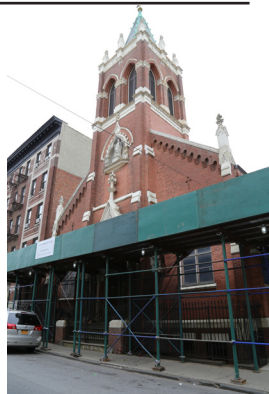
St. Adalbert Church - $964,850