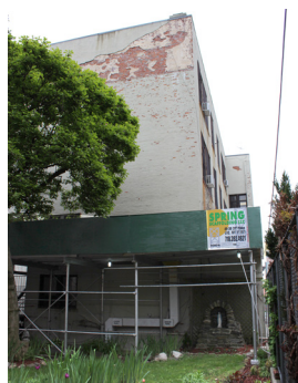
Youth Center - $337,560