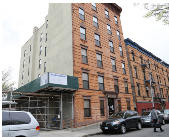
St. Anthony Shelter - $330,000